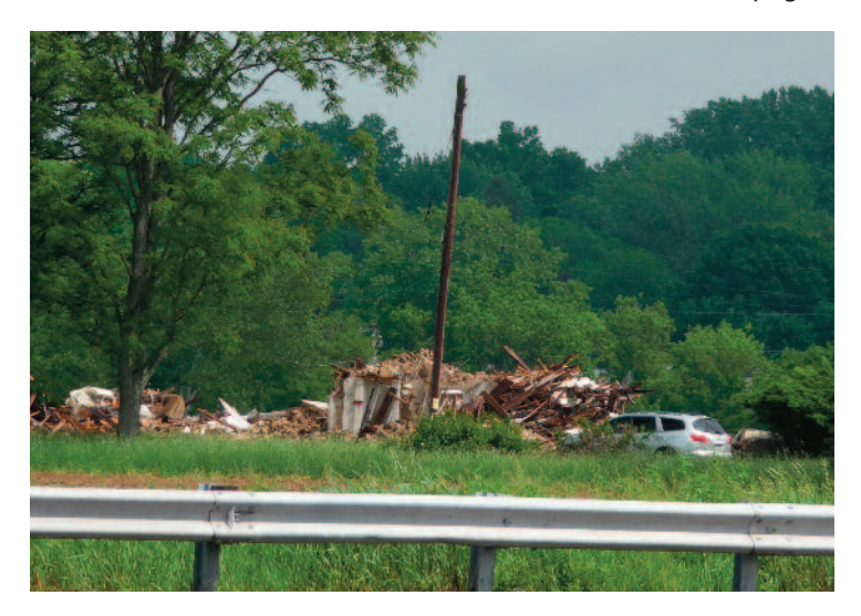
The Penrose House, end of day, May 20, 2011.

<sup>(2)</sup> "Buyer shall preserve the architecture integrity of the property's principal residence by incorporating the principal residence into the Project. The use of the principal continued on page 5