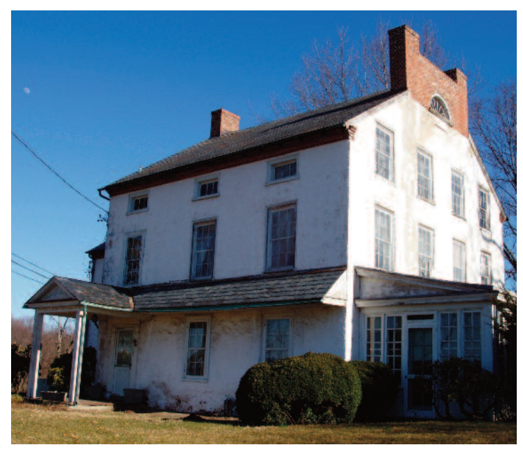
The Penrose House, as it stood for over 260 years.

<sup>(1)</sup> This action was due to (per a letter written by prop-